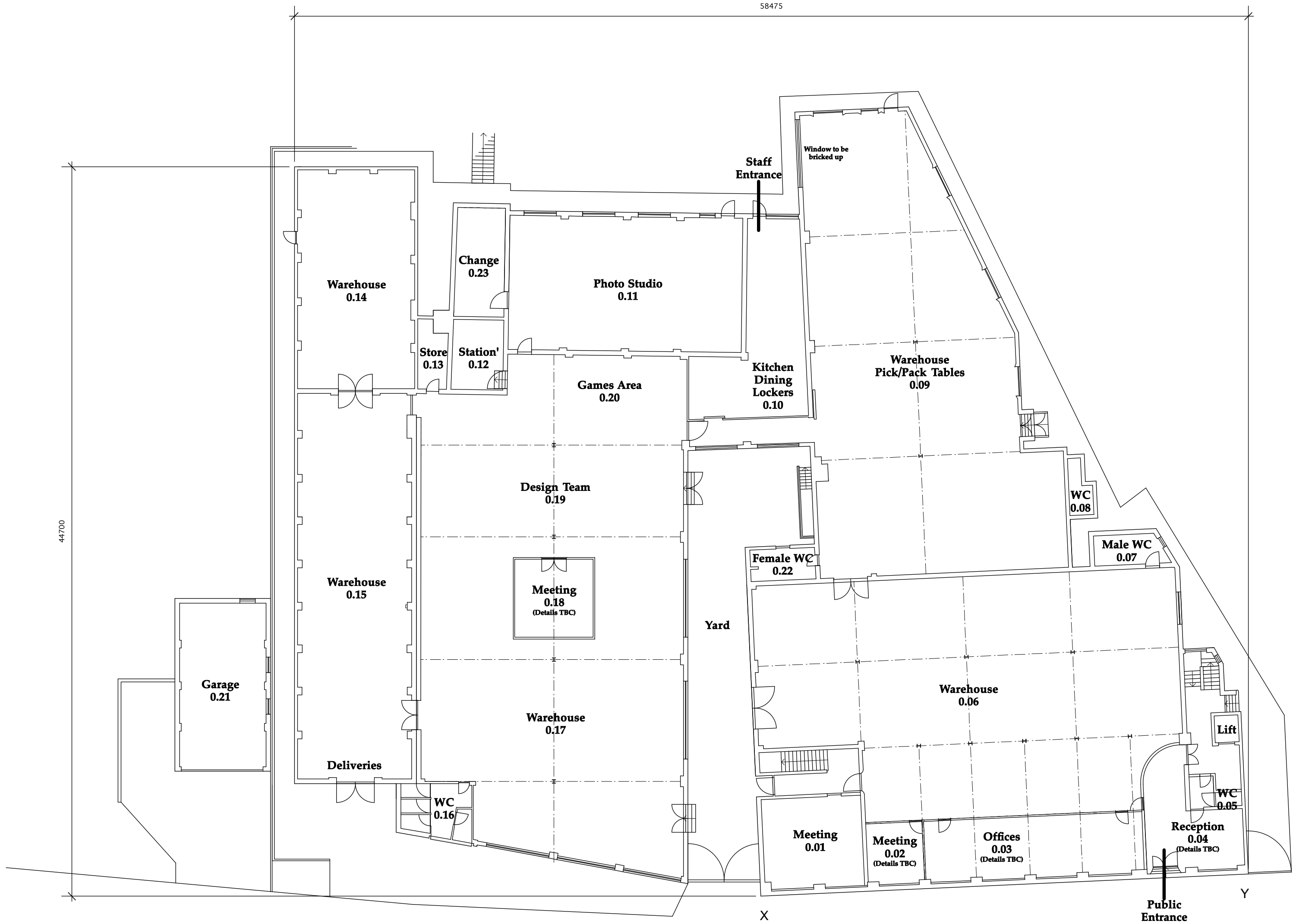
Ground Floor Plan - 1:200 - 1,970sqm